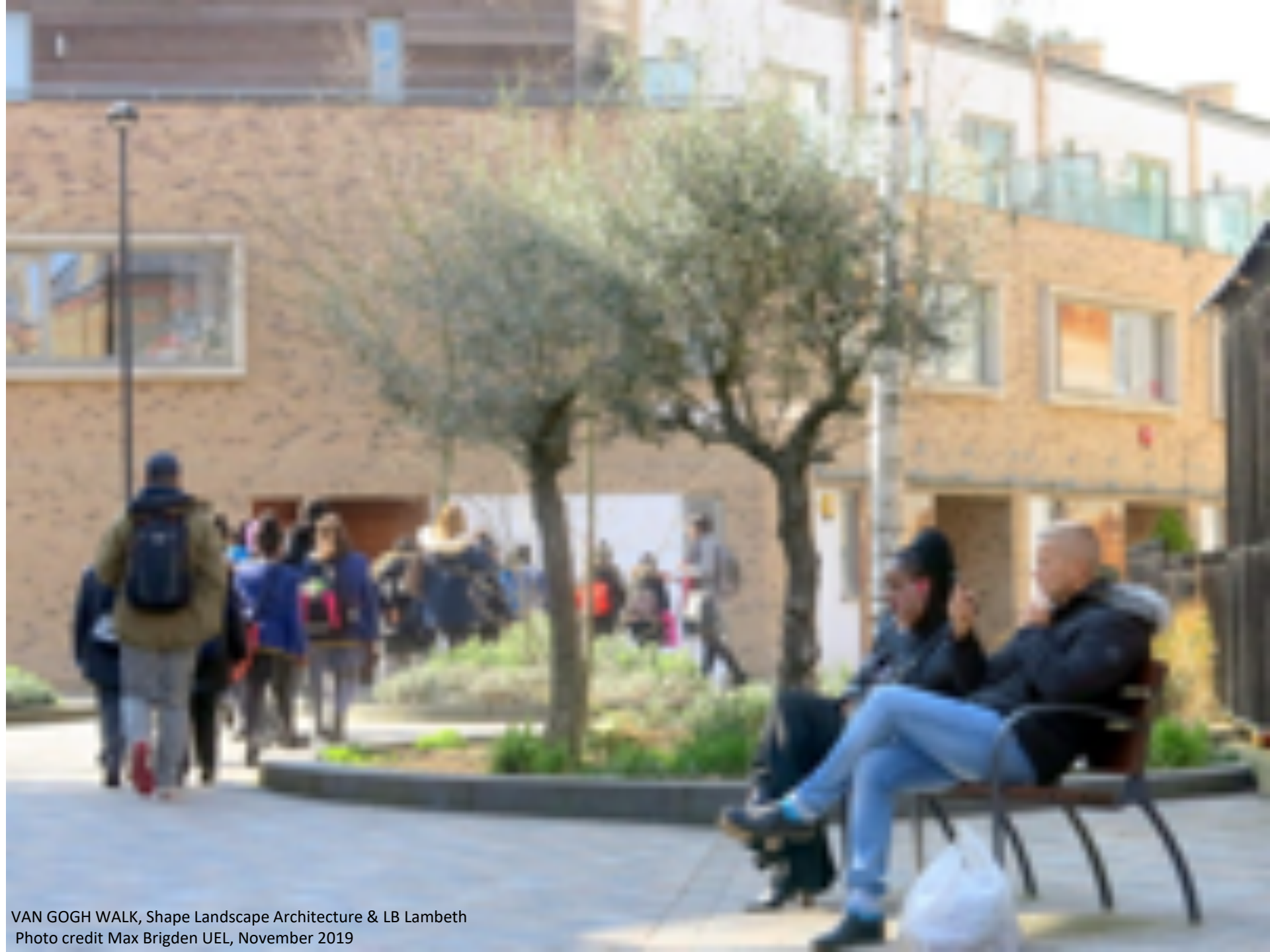
VAN GOGH WALK, Shape Landscape Architecture & LB Lambeth Photo credit Max Brigden UEL, November 2019