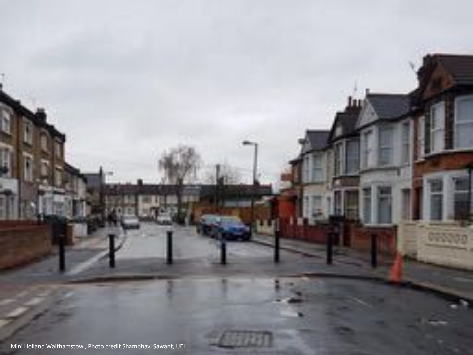
Mini Holland Walthamstow