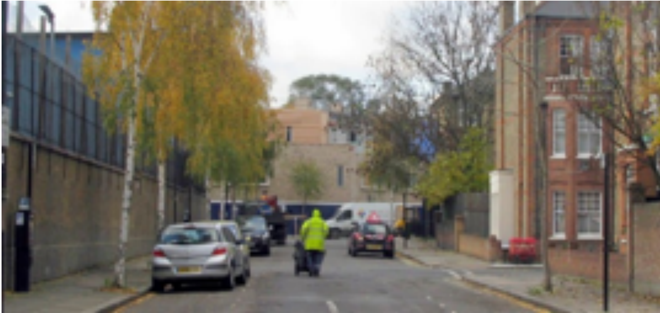
VAN GOGH WALK (as Isabel Street in 2012), Shape Landscape Architecture & LB Lambeth 2013