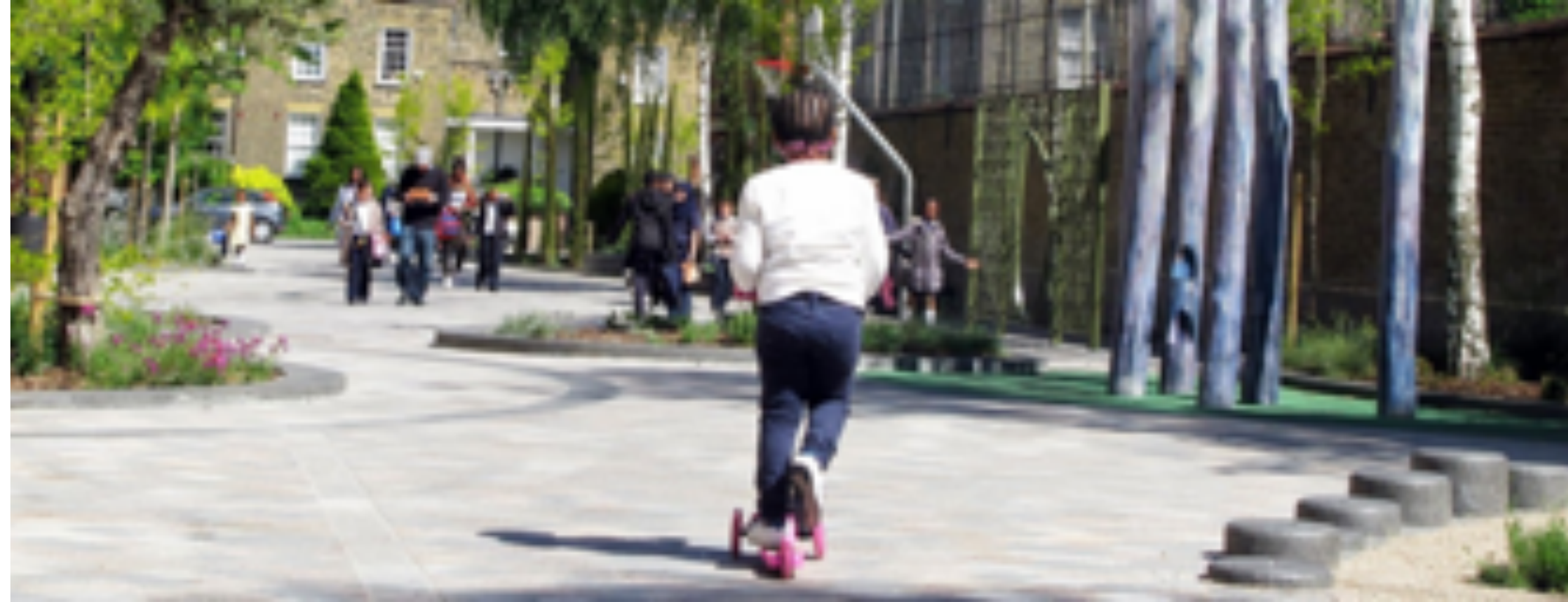
VAN GOGH WALK, Shape Landscape Architecture & LB Lambeth 2013