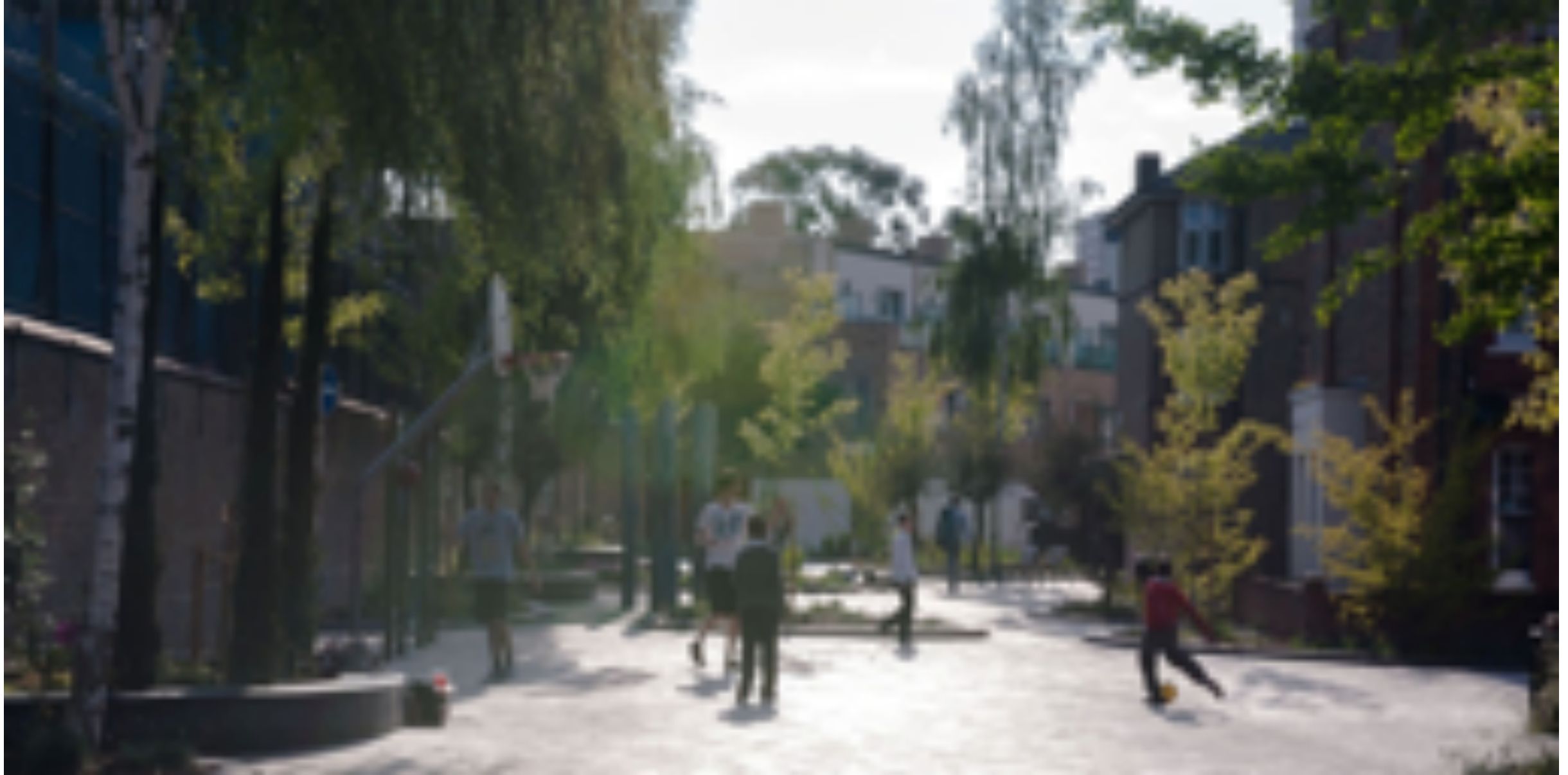
VAN GOGH WALK, Shape Landscape Architecture & LB Lambeth 2013