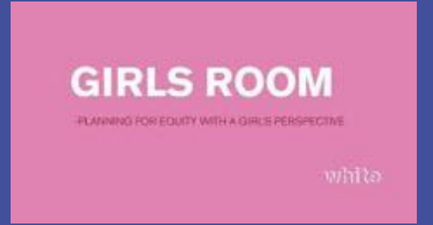
Girls & Young Women