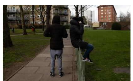
'So then you don't have space at home... You're going to feel like you belong outside on the street right?'

They highlight school exclusions, poor education, inflammatory social media, the lack of decent jobs, youth service cuts and racism. But one theme keeps recurring: the struggle for space and territory, at home or on the streets, and the corrosive effect of its absence.