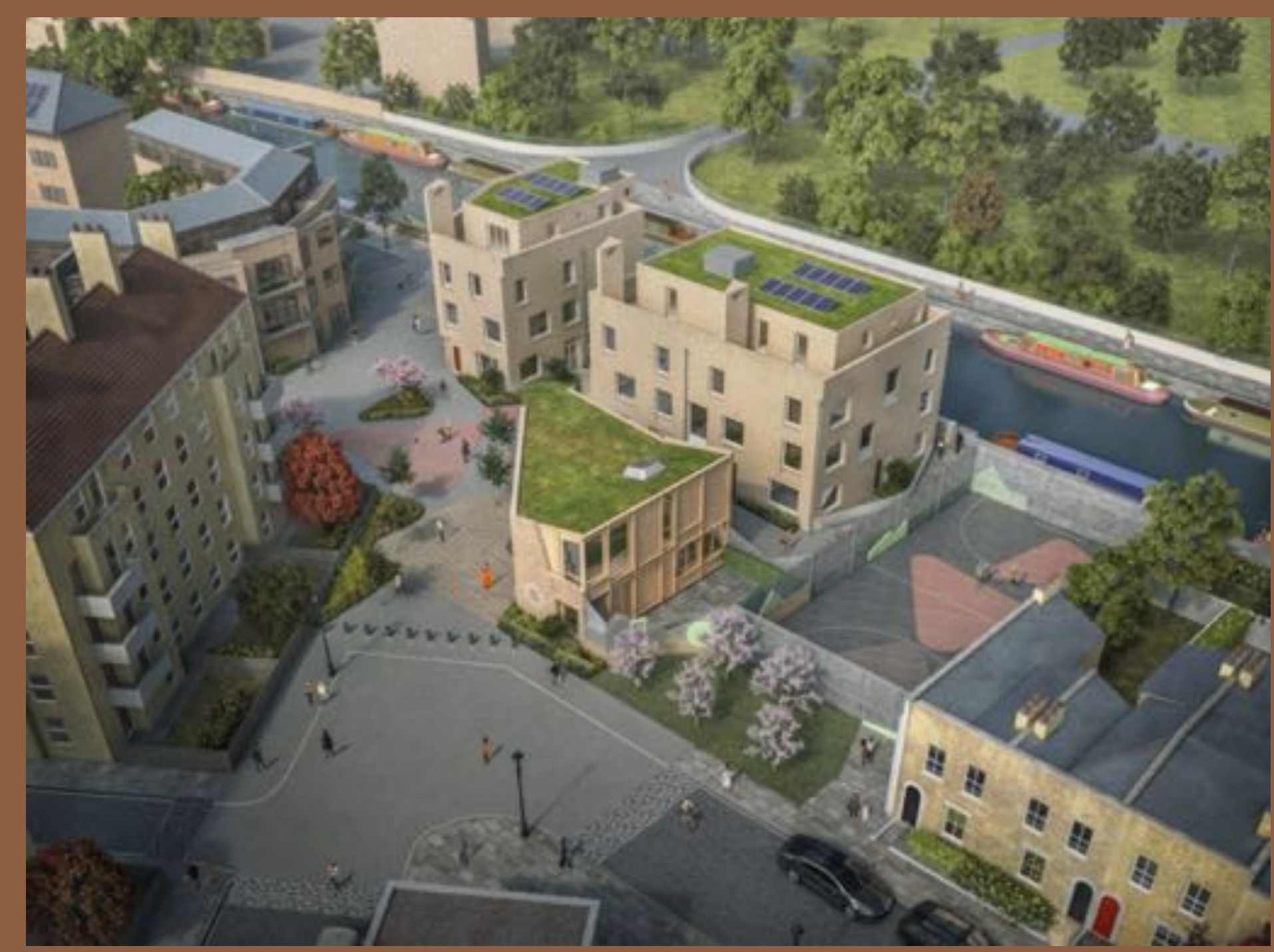
5 Ways to Wellbeing