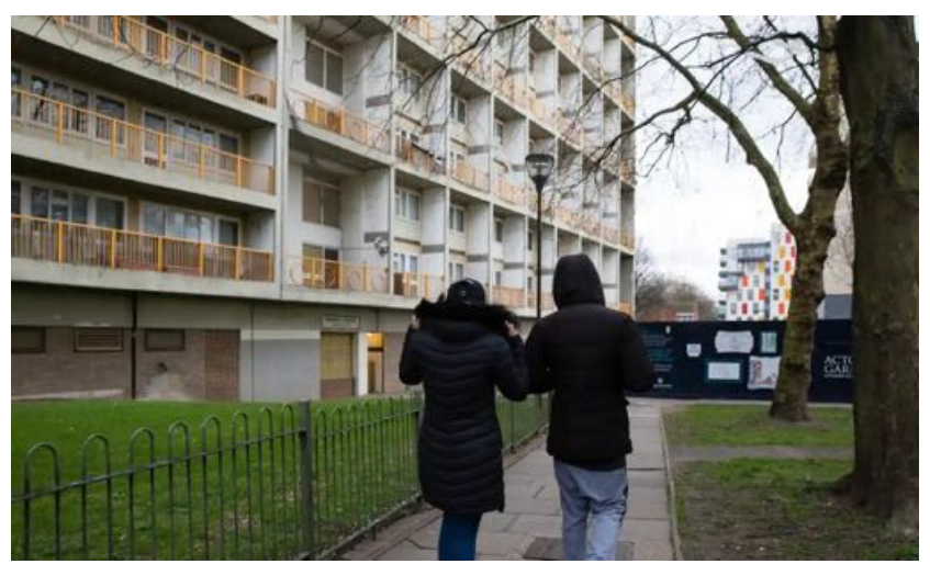
Two members of the Bollo youth club in Ealing, which has seen funding slashed.

Cramped conditions at home feed territorial disputes, say teens at a west London youth centre