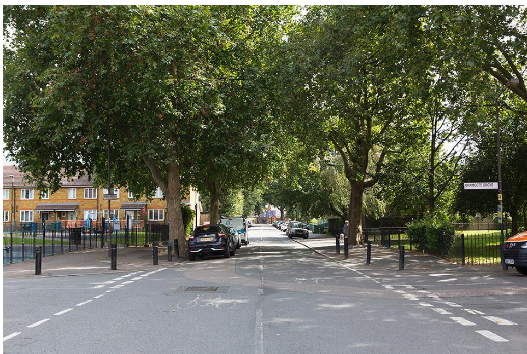
Verney Road dividing the park in two sections