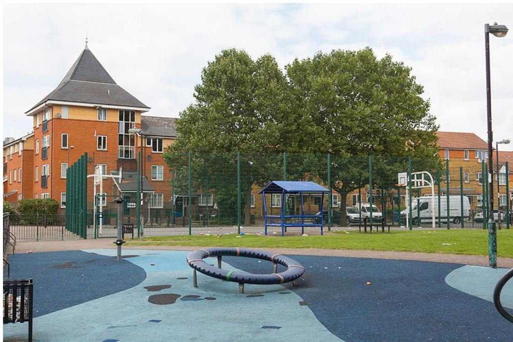
Play area, north section of the park

Bramcote Park forms part of the Bonamy and Bramcote estate which was built in the 1990s. The western part of the estate replaced the former Bonamy estate, which was demolished and rebuilt in the 1990s and is owned by Southwark council. Homes on the eastern side of the estate are owned by the council, as well as two housing associations, Notting Hill Genesis (NHG) and Optivo. The park is divided in two by Verney Road. The southern part is older, being identified in the 1931 London Squares Preservation Act, while the play facilities on the north side were laid out when the area was rebuilt in the 1990s. Today the park itself is owned and maintained by Notting Hill Genesis and Optivo.