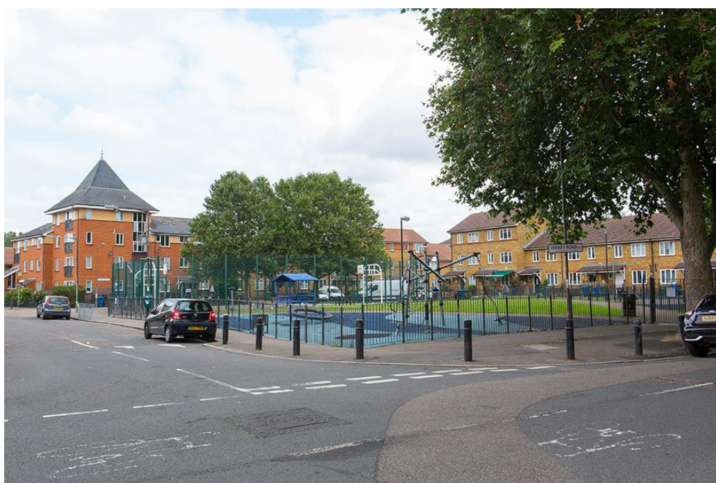
View from the intersection of Bramcote Grove and Verney Road