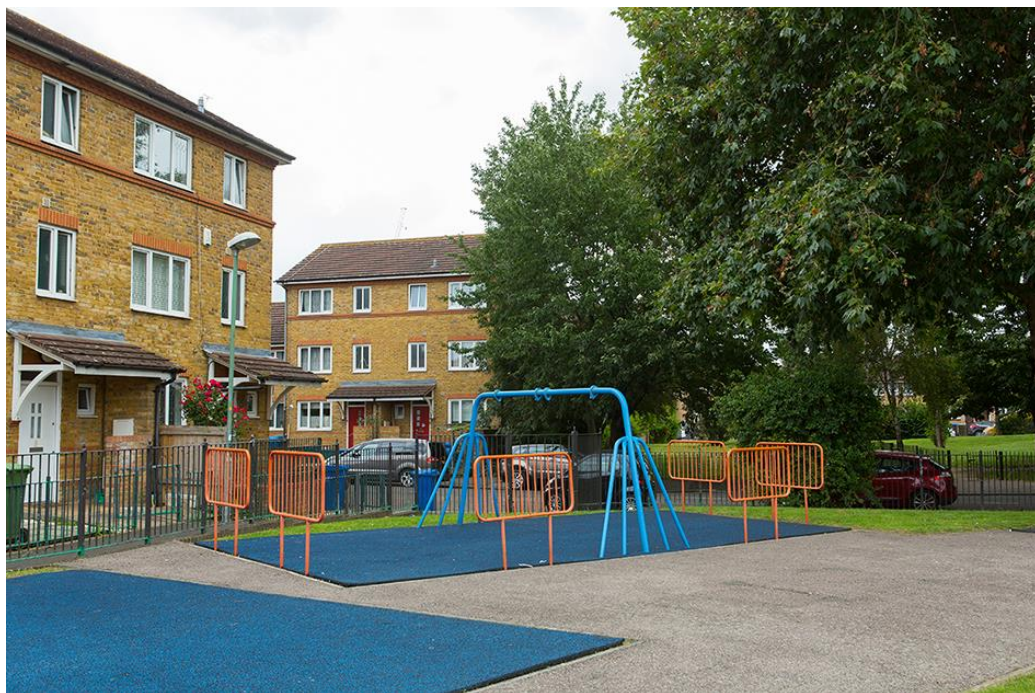
Play area for young children, north section of the park