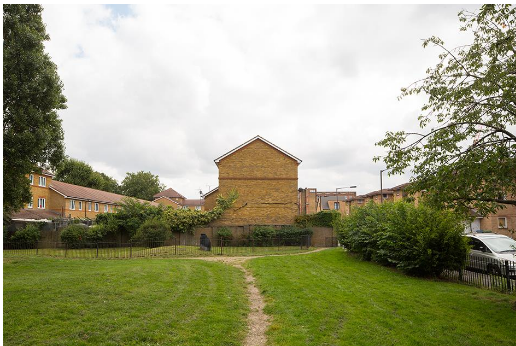
Enclosed dog park, south section of the park