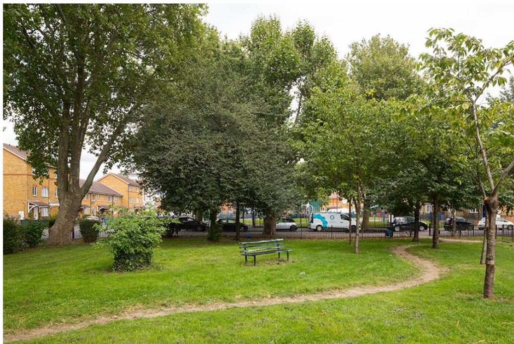
Nature Garden, south section of the park