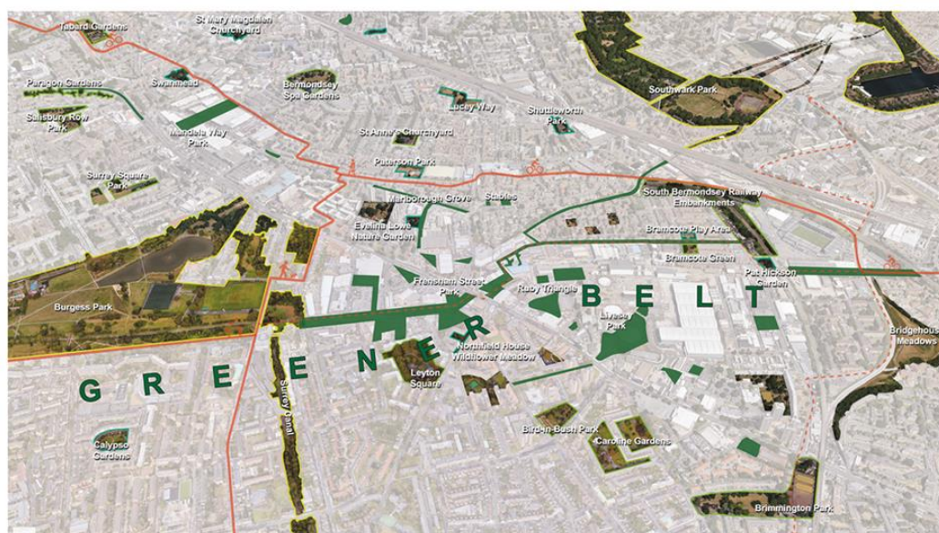
Parks, Streets and Open Spaces - Green links map