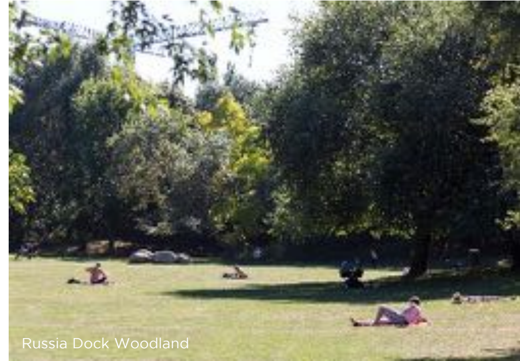
Russia Dock Woodland