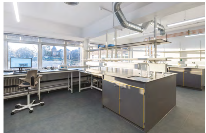
The Innovation Gateway

The site can accommodate up to 1 million sq ft of development