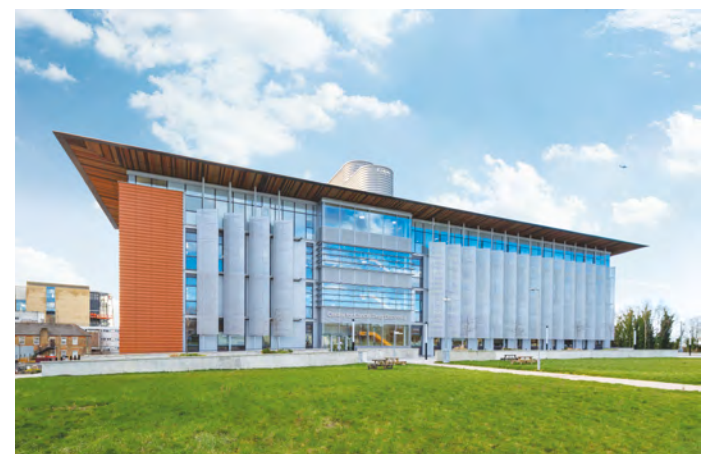
Centre for Cancer Drug Discovery