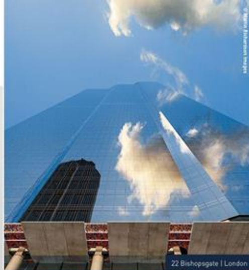
22 Bishopsgate | London