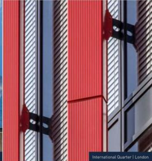
International Quarter | London