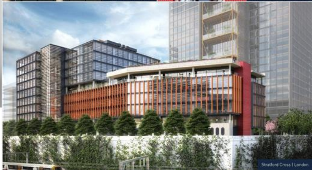
Stratford Cross | London